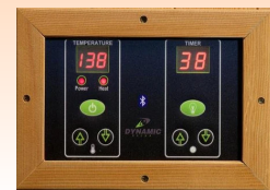
Easy To Use Controls (may vary depending on model)