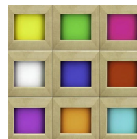
Chromotherapy Light With Multiple Colors